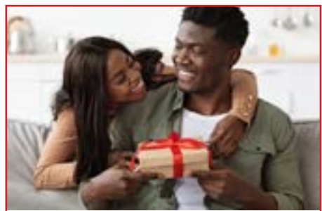
Woman gives her significant other a gift

Since the dawn of time men have been looked down upon for showing emotional vulnerability. They have been scolded for expressing their feelings and many are taught at a young age that it is a sign of weakness.