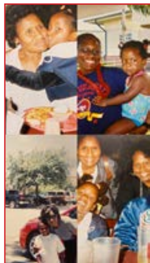
A lifetime of maternal love shines bright on Valentine’s Day.

Click link to continue: http://www.thefamuanon-