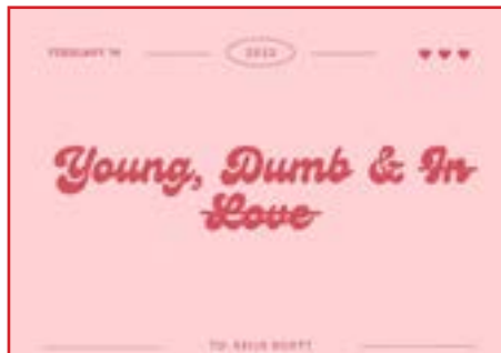
There is a large percentage of single people who haven’t experienced love.

The aroma of chocolates in heart-shaped boxes and rose petals that have fallen from their stems flows through one’s nose, signifying that love is truly in the air.