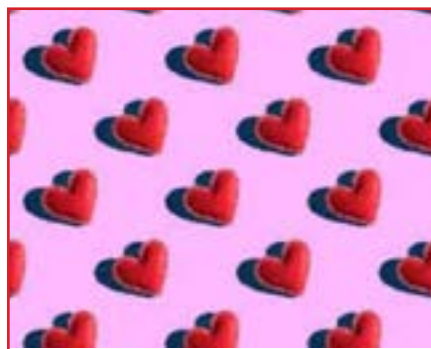
A sea of hearts showing the symbol of love.

Showing your partner admiration only on Valentine’s Day is very common with some people. Love is essential in relationships and can be shown every day. Simple gratification is romance in itself.