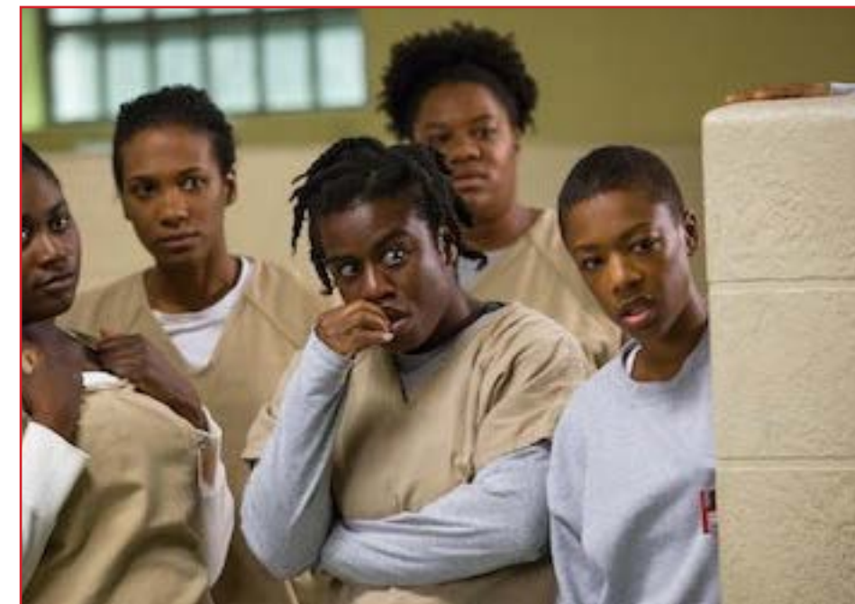
Photo shows characters of Netflix’s show “Orange is the New Black”

Misinformation and myths about sex persist in many young adults’ lives due to the lack of education and shared knowledge. In the absence of accurate information, young adults may believe and spread false information about sex and sexuality, leading to confusion and stigma. In the quest for knowledge and understanding, many turn to the inter