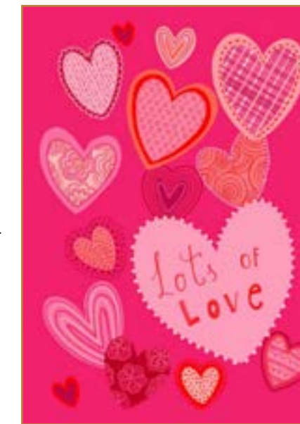
The debate of posting or not posting your partner can have extreme effects on love.

Accepting and entertaining DMs might lead to a relationship's demise. There is an art to dealing with an improper DM