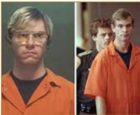
Actor Evan Peters playing the role of Jeffery Dahmer (Left). Actual photo taken of Jeffery Dahmer. (Right).

At least 56 million households have watched all 10 episodes, according to Netflix data. This has sparked several conversations on social media amongst