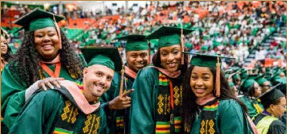
FAMU’s four-year graduation rate declines 7%.

Data like four-year graduation and retention rates are definitive numbers that leave universities on the hook for creating goals and establishing ways to meet them.