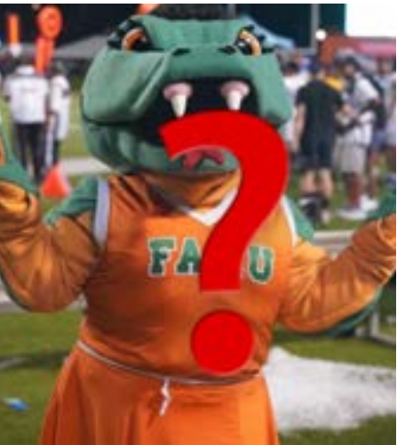
Lady Venom showing school spirit

Click link to continue: http://www.thefamuanonline.com/2022/10/14/lady-venom-is-mia/