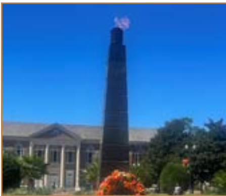
The Eternal Flame.

“I don’t feel like Tallahassee honors FAMU the way that it should because I