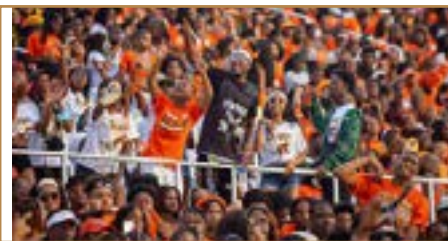
FAMU vs Alabama State game student section.

However, the box office informed students via email that there would only be 3,500 student tickets available for the game. Once all the free student tickets