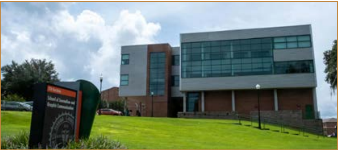
SJGC building.