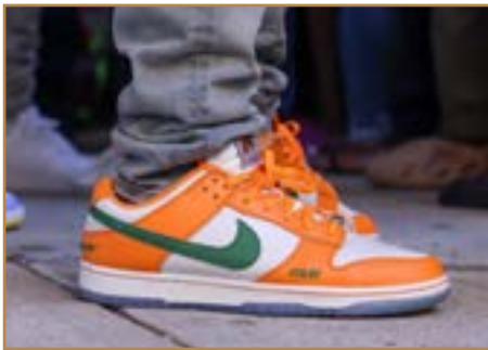
Nike’s new FAMU sneaker.

The campus and culture of FAMU were considered in the creation of the shoe.