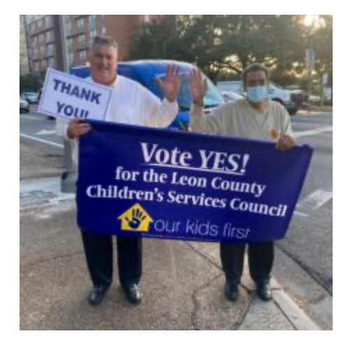
The Children's Services Council had a strong advocacy group.

One of the big local winners in last week's election was the Children's Services Council. With surprisingly strong support, the citizens of Leon County have given the green light to create a governmental entity.