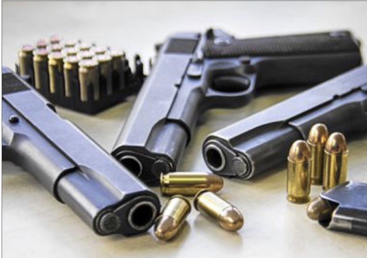
Guns and bullets

The legislative measure differs slightly by indicating who would sit on the com-